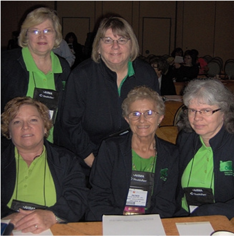
OrHIMA Delegates to the 2010 AHIMA House of Delegates